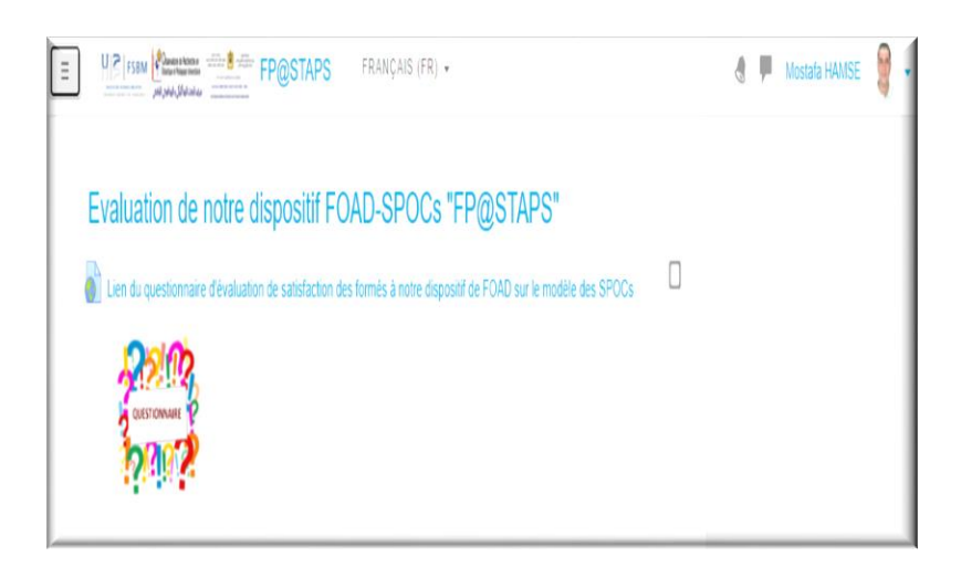
Figure 4: Screenshot of participants' satisfaction towards ODL-SPOCs device.

system (Figure 4.).It contains a link to the questionnaire that participants must complete within the specified deadlines.