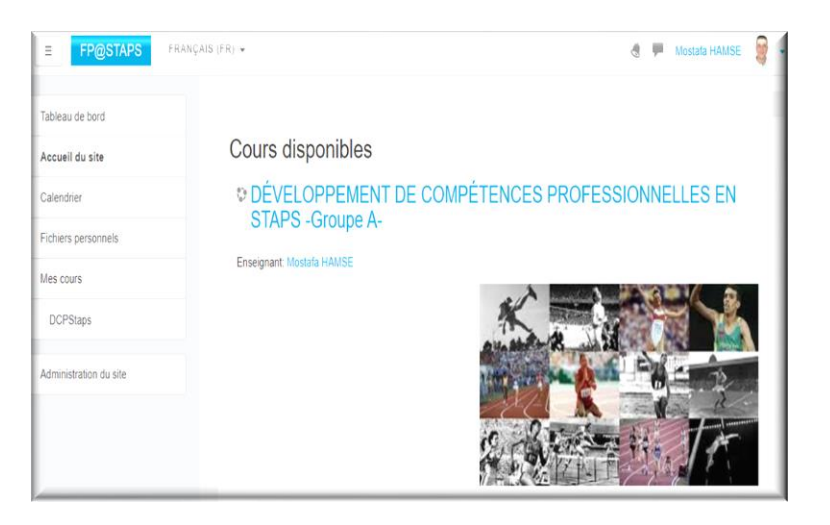
Figure 1: Screenshot of SPOC's home page.

The formulation of our pedagogic objectives is organized and classified based on Bloom's taxonomy (Krathwohl, 2002) [49].Our first training course entitled "Strengthening Basic Athletics Skills" is structured following three lower levels of Bloom's taxonomy which are: "Memorize, understand and apply".Its objective is to identify the basic concepts relating to athletics, namely: some definitions of experts in field, a classification of its different families and disciplines sports as well as a technical and regulatory analysis of some sports activities in athletics.The second course entitled "Professional skills to teach PES" is ranked according to three higher levels of Bloom's taxonomy, namely "Analyze, evaluate and create ".It aims to acquire trainee teachers basic professional skills related to teaching PES: planning, management and evaluation of learning through professional analysis of their teaching practices.