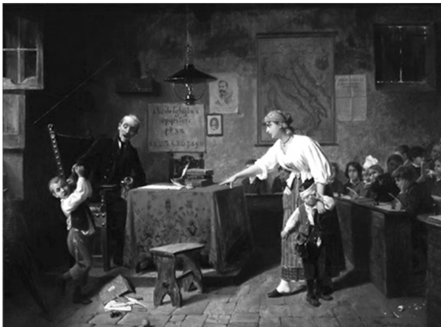
Fig. 10.5: Giacomo Mantegazza, La lezione allo scolaro o Chi la fa l'aspetta , oil on canvas, n.d., 76.2 x 105.4 cm. [Private collection].

urban schools appear to be perfect: a far cry from that we could name “impossible schools” that were often the only option available to children from rural families in the southern interior, where it would appear that “Italy” had not yet become a reality.