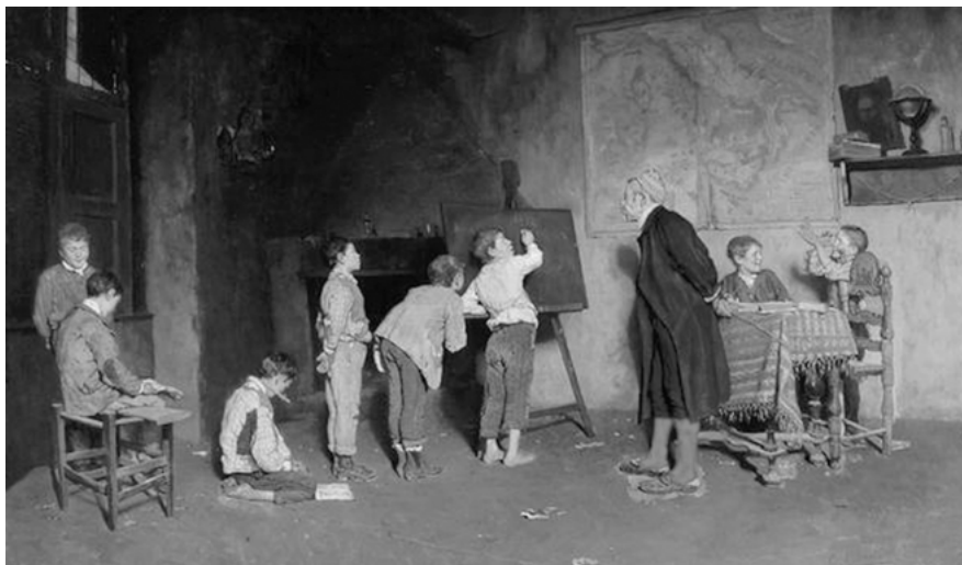
Fig. 10.4: Giuseppe Costantini, La scuola del villaggio , oil on canvas, 1888, 40.1 x 63.7 cm. [Calderdale Metropolitan Borough Council Museums and Arts, Halifax – United Kingdom].

stand at attention” 36 and the punishment of the horse, that “consisted in striking with a whip one who is lifted up on the back of another”. 37 Cicconi’s ideological perspective on corporal punishments used in the schools of pre-Unification states recurred in his painting La scuola sotto i passati governi [School Under Past Governments], in which the walls of an almost empty classroom – themselves resembling “chewed bread” – were adorned with a handwritten notice that proclaimed: “Che buon pro facesse il verbo / Imbeccato a suon di nerbo / Nelle scuole pubbliche” [What good is the word / Prompted by the sound of the whip / In public schools]. 38