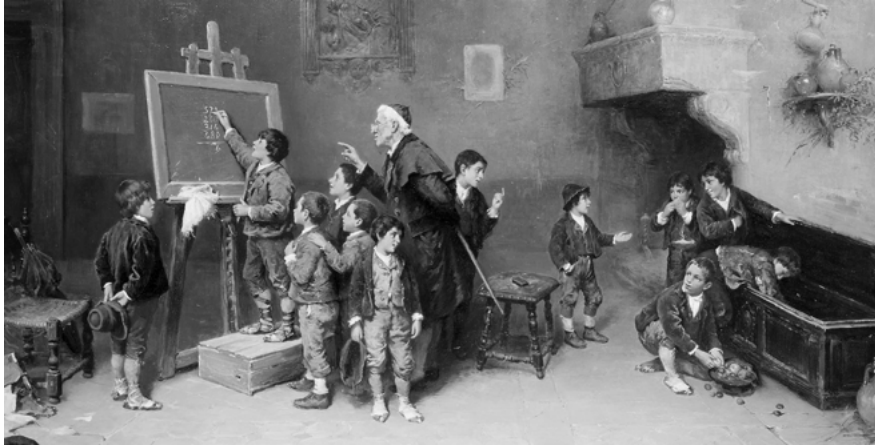
Fig. 10.1: Francesco Bergamini, Una lezione importante , oil on canvas, n.d., 50.5 x 81 cm. [Private collection].