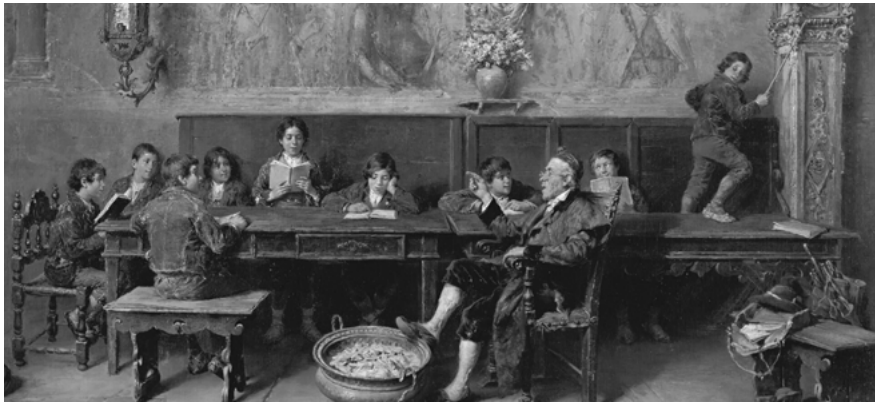
Fig. 10.2: Francesco Bergamini, L'alunno disubbidiente , oil on canvas, n.d., 55.3 x 90 cm. [Private collection].

education, which they saw as usurping their educational prerogatives. 31 By associating members of the clergy with a reactionary and conservative approach to education, and sympathetically representing the children's innocent, though irreverent, playacting, a