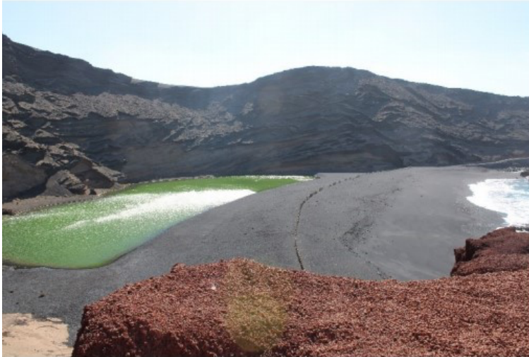
Figure 2: El Golfo and its black sand beach.

Using Lanzarote as a good example, they illustrated how stakeholders were able to develop a sustainable tourism strategy by taking advantage of the island's specific characteristics, themes and values: its distinctive natural landscapes, geological features, biodiversity, gastronomy, culture and sport and the figure of César Manrique.