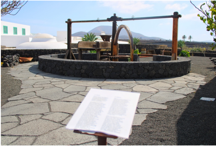
Figure 3: a flour mill (tahona) in the Casa Museo del Campesino.