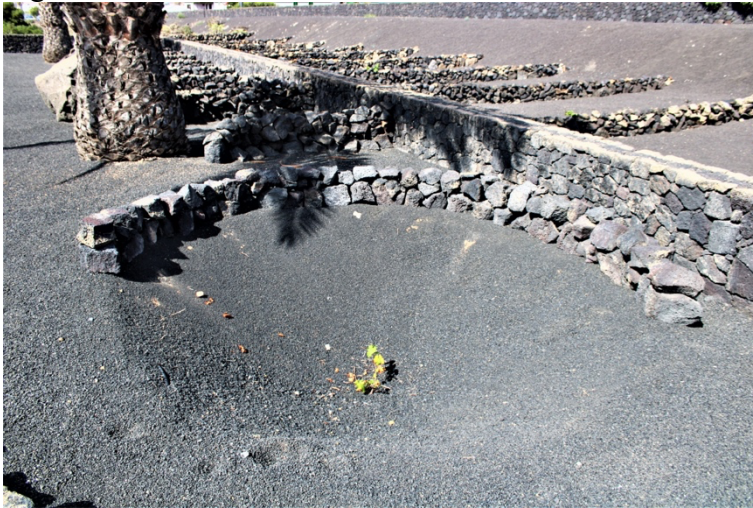
Figure 4: an example of “socos”, a typical farming technique in Lanzarote.

The Castle of San José (opened in 1976) is another symbol of the historic architecture of Lanzarote. Built between 1776 and 1779, it had no defensive purpose other than being used as a depository despite its form. When César Manrique was developing his project, the castle had been abandoned for over a century. He wanted to restore and give it new functions, and it was finally converted into the current International Museum of Contemporary Art.