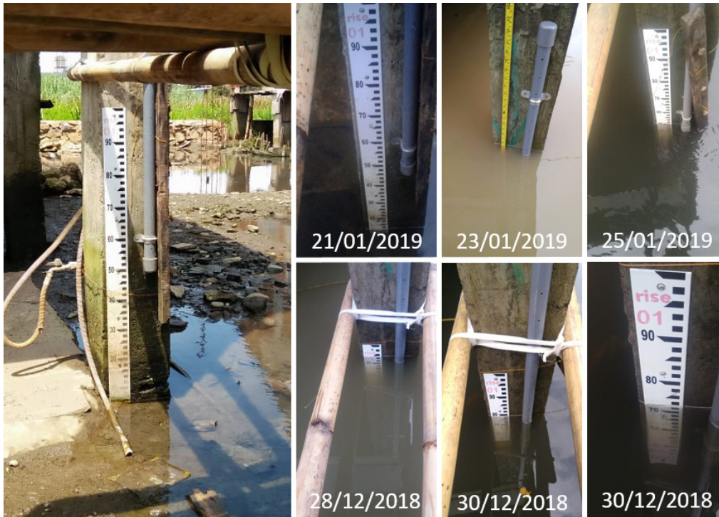
Figure 1. Flood gauge in Makassar, Indonesia, photographed by residents in different conditions during floods in 2018 and 2019.

The preparation for the project consisted of the installation of a gauge and a crest level indicator in each of the flood-prone settlements in a position where the participants could safely photograph the gauges and register water level fluctuations. The participants were instructed to use their personal smartphones to send photos of the flood gauges daily (see Figure 2) in order to keep a record of the water levels throughout the whole season. The RISE staff members that engaged the communities instructed the participants to photograph the