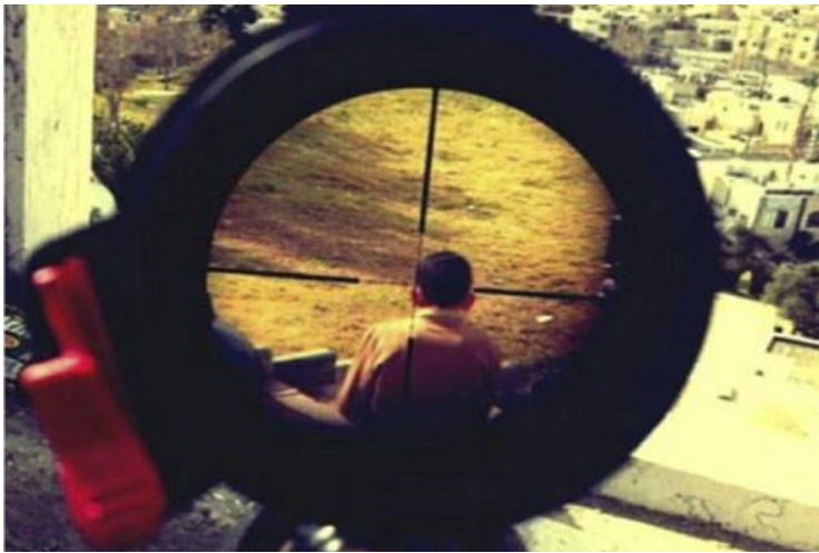
Figure 7. A Palestinian boy viewed from the lens of the gun of the Israeli soldier Mor Ostrovski. An example of ideological aesthetics on Instagram, where the weapon and camera have become one, and the beauty of the image serves the photographer's inhuman purpose (Kohn, 2016: 203)

Figure 8 shows a photograph shared on Instagram by the Israeli Ministry of Defense entitled "Army and Peace". This photo is an example of an Instagram image that has become aesthetically ideological and political.