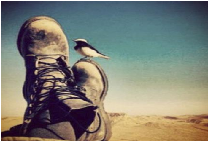
Figure 8. A photograph shared on Instagram by the Israeli Ministry of Defense entitled "Army and Peace". This photo is an example of an Instagram image that has become aesthetically ideological and political (Kohn, 2016: 208).

objects are brought together to create a narrative or simply a beautiful environment. The liking and sharing of images is perceived as approving of others' ideas. Immediate implications arising from any use of social media and the interpretation of these implications and signs, mutual commonalities, social liberty, and membership in a community incorporating new cultural trends help this app and its websites to be a sample of social media stereotype. The semiotic norms of social media primarily appear in the visual representations of the self, and in this regard Instagram contains the highest number of semiotic interpretations.