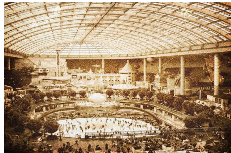
Figure 1 and 2. Examples of photos that have been edited by applying the faux-vintage filter and looks older than they actually are (Kohn, 2016: 200)

It should be noted that the photos filtered by Instagram are self-conscious simulations, intended to simulate a particular historical time, mode, or condition and give the false impression of the passage of time.