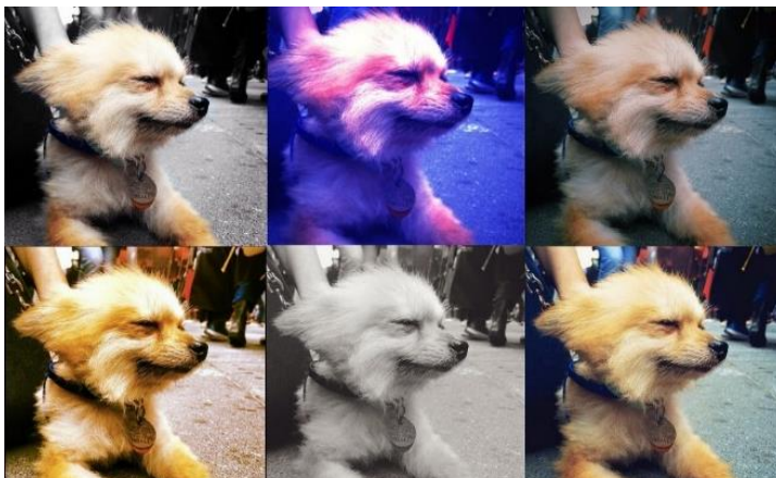
Figure 4. An example of the effect of applying five Instagram filters to the same image (Kohn, 2016: 201)