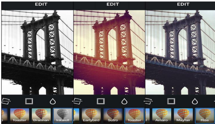
Figure 3. An example of various filters applied to an image in order to create a different visual sense and pictorial appearance (Kohn, 2016: 201)

From this perspective, when techniques such as saturation, blurring, contrast, etc. are used so extensively they become less like an artistic choice (the 'artistic aura' remarked upon by Benjamin) and more of a trend or fashion (what Baudrillard referred to as the logic of fashion). Figure 3 shows an example of various filters applied to an image in order to create a different visual effect. Figure 4 shows an example of the effect of using three Instagram filters, namely, 'Rise', 'Inkwell', and 'Toaster', in order to make visual changes that lead to a different aesthetic perception. Figure 5 shows an example of applying two filters in Instagram in order to increase or decrease the richness of the image which, aesthetically, causes the bird image to appear closer, more realistic, and more tangible, or on the contrary more distant and more intangible.