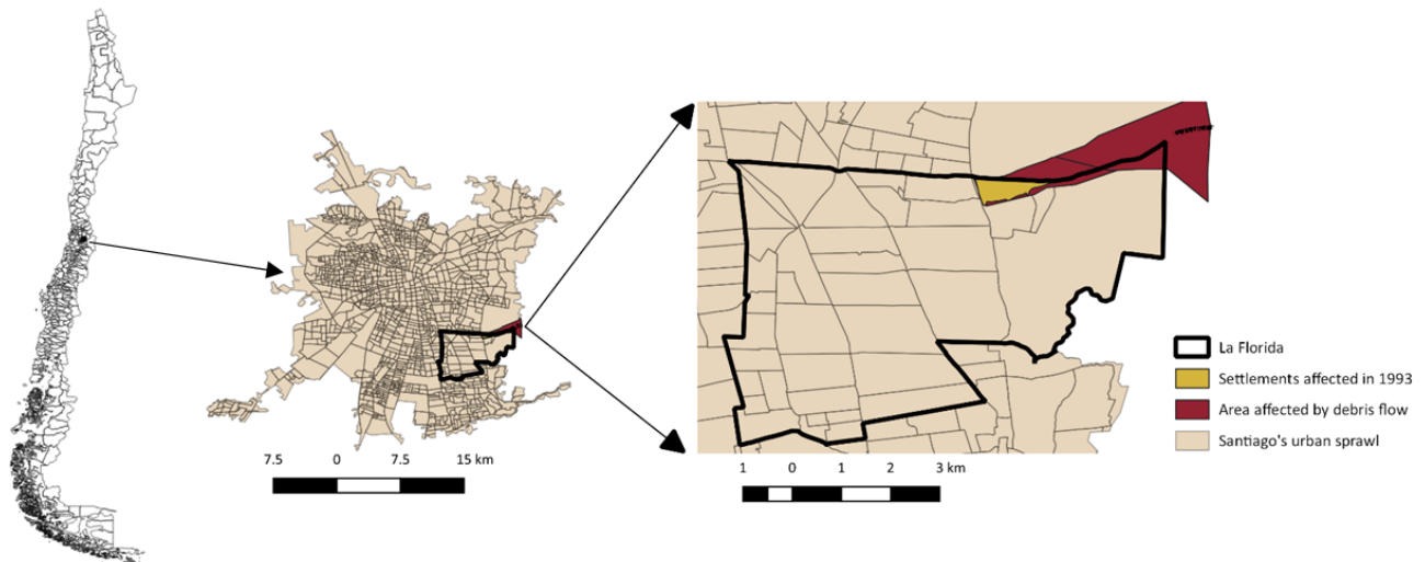
Figure 2. Research area in south-east Santiago, Chile.

Emergencias, 1995). The most affected households belonged to La Florida, a comuna (Chile’s lowest tier territorial division) in south-east Santiago. 23 people died, 8 disappeared, 85 suffered severe injuries, and 3,800 people lost their home. The relief and recovery entailed victim relocation to an emergency camp for almost two years, and subsequently to a newly constructed public housing project called Santa Teresa located near their original dwelling, but in an area protected from the overflows of the Macul Ravine (Secretaría Regional de Vivienda y Urbanismo [SEREMI]–Ministerio de Vivienda y Urbanismo [MINVU], 2013).