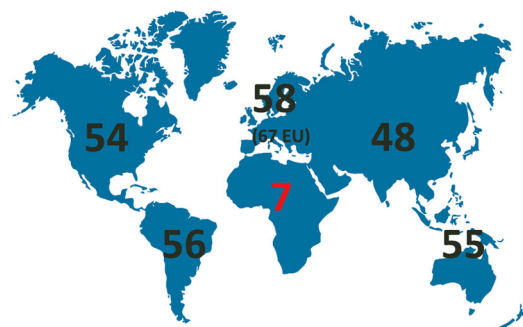
FIGURE 1 The COVID-19 vaccine inequity as of November 2021. Only 7% of the African population have received full vaccination, while developed countries (e.g., the European Union with 67% of the population fully vaccinated), with high vaccine uptake, were already recommending booster doses. Based on data by ref. 55 This inequity strongly advocates better support of vaccine aid in low-income countries and emphasizes that initial vaccinations over booster strategies must be prioritized 56

It remains unknown whether the variants of concern emerged due to a longstanding infection in immunocompromised individuals due to prolonged treatment with convalescent plasma or monoclonal