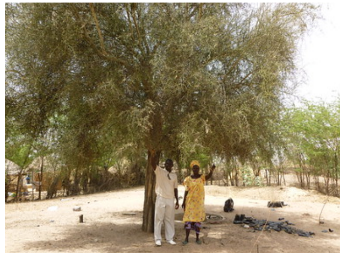
Figure 5. Balanites aegyptiaca (desert date) in Senegal. Balanites is commonly used in GGW activities and the fruits provide food in the dry season

Human health: Although not the primary focus of GGW activities, the potential co-benefits for human health are diverse and substantial. Undernutrition can be addressed, especially in the lean season, by the presence of easily consumable fruits (Sinare and Gordon 2015). Nutritional status can also be improved through fruit, seed and leaf consumption, especially if species are being reintroduced to a region and thus increasing biodiversity (Bayala et al. 2014; Ramde-Tiendrebeogo et al. 2019). The presence of traditional medicines as well as of certain micronutrients can improve chronic and noncommunicable health conditions (Duboz et al. 2019). Long-term health status can also be improved due to the indirect impacts of restoration. For example, trees and shrubs can decrease erosion and provide windbreaks, both of which decrease ambient dust locally and across the continent and could thus improve respiratory health (Bellefontaine et al. 2011; Heft-Neal et al. 2020).