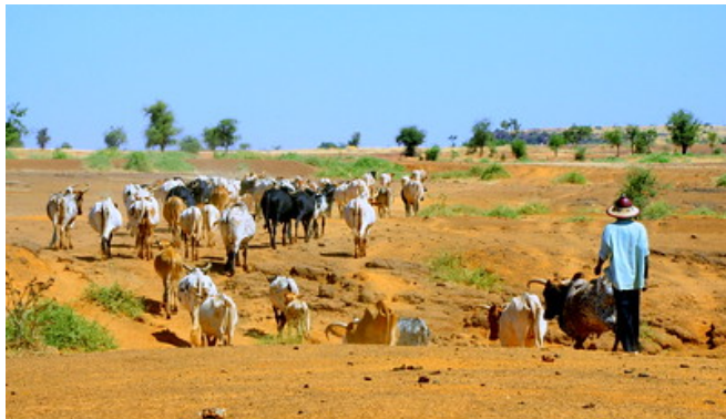
Figure 4. Cattle in a silvo-pastoral system in Burkina Faso

Productivity: The impacts of GGW activities on agricultural productivity are predicated on the soil and water improvements highlighted above. Cropland productivity can increase with improved soil fertility and structure and improved water holding capacity, but the choice of tree and shrub species has a mixed impact on overall crop yields (Sinare and Gordon 2015). Integrated agro-pastoral and silvo-pastoral systems can produce multiple types of agricultural products and impacts can be maximized appropriate species are included in restoration efforts (O’Connor and Ford 2014). GGW activities can improve livestock productivity by providing a sustainable source of fodder as well as shade, which mitigates heat-related stress on animals (Sinare and Gordon 2015).