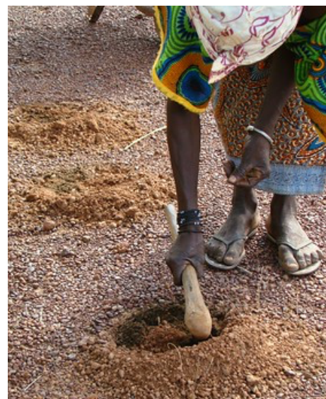
Figure 3. Zai holes for pearl millet in Burkina Faso (credit: CCAFS)

Soil and water: Restoration, mostly through tree planting and assisted natural regeneration, has the potential to improve soil health and water availability. A study of potential tree species for the GGW in Senegal (Diallo et al. 2017) validated many previous studies that find significant improvement in soil microbial health and available nutrients under tree canopies when compared to non-tree canopy soils. Tree and shrub cover can improve water infiltration and groundwater recharge, both of which are important elements of the soil-water-nutrient cycle that underlies long-term improvements in landscape resilience in semi-arid regions (Ellison and Speranza 2020). Other impacts on soils and the water cycle of GGW activities, like increased erosion from increased heavy rainfall events, require additional adaptive activities to minimize adverse impacts (Saley et al. 2019).