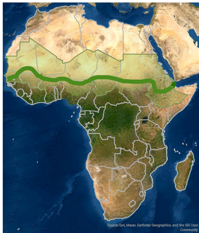
Figure 1. Map of the planned Great Green Wall path

view of the potential of the GGW to deliver co-benefits for many of the United Nations Sustainable Development Goals (SDGs). However, the potential ripple effects that GGW activities could generate and the underlying properties of the environmental and social systems in the Sahel that these potential impacts suggest have not been made explicit.