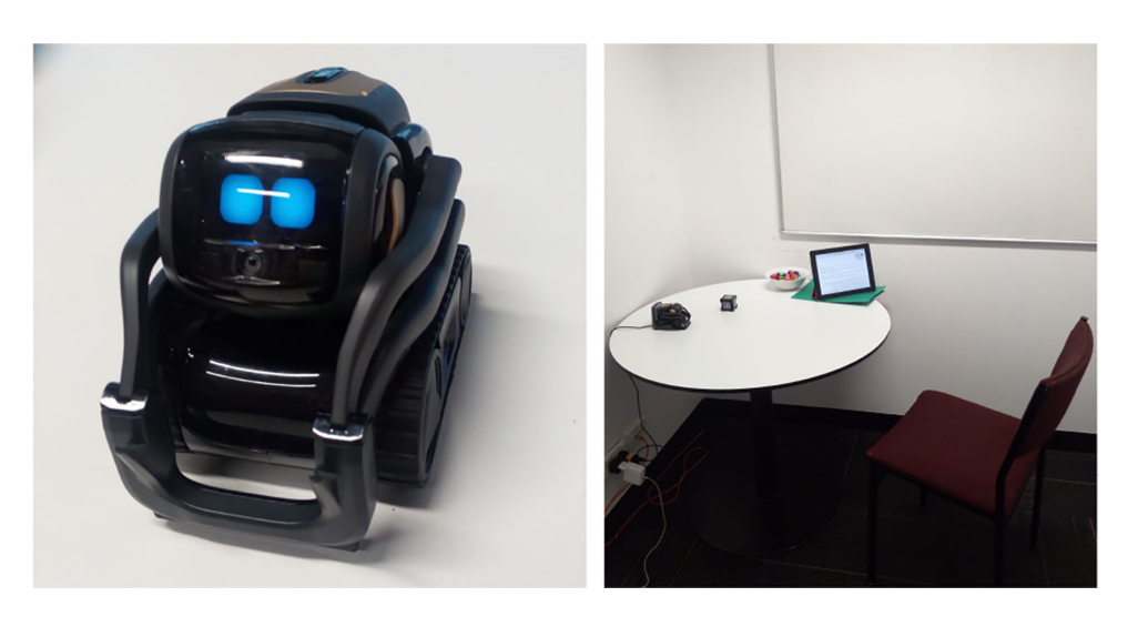
Fig. 2 Left; the vector robot. Right; the study set-up