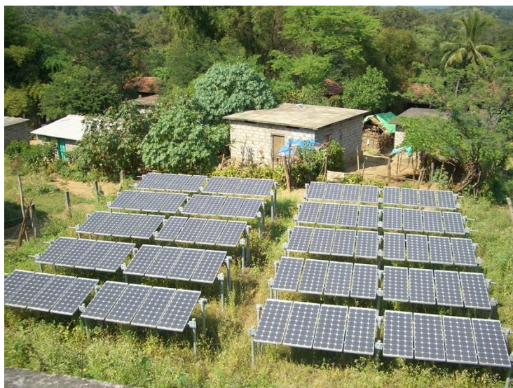
Figure 3: A typical Remote Village Electrification Project

ANERT has implemented many successful solar projects in the last decades. The projects include Remote Village Electrification Programme (RVEP), 10000 solar roof-top programmes, etc. ANERT has successfully implemented programmes of the Central Ministry (MNRE – Ministry of New and Renewable Energy) like the dissemination of Solar Lanterns, Solar Home Systems and Solar Street Lighting Systems, etc. ANERT has recently come up with a Grid Connected Solar Programme for residential buildings in the State called “Solar Connect” with both Central and State financial assistance. The off-grid solar programme for the residential buildings in the State is called, “Solar Smart”. ANERT has become the first solar Independent Power Producer (IPP) in the State by installing a 2MW Utility scale PV plant at Kuzhalmannam, Palakkad District in Kerala (Figure 4)