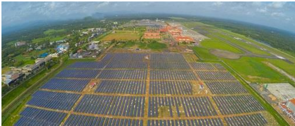
Figure 6: 30MWp Solar PV power plant at Cochin Airport

Kerala State Electricity Board Limited (KSEBL), the major Power Utility in the State, has also taken up PV Power Plant projects in the State. KSEB has installed a 1MW Grid Connected PV Power Plant Project at Kanjikkode, Palakkad District. The biggest Solar farm installed in Kerala so far is the 30MW Plant at Cochin Airport premises by Cochin International Airport Limited (CIAL). This is the first Airport in the world to be completely powered on solar power (Figure 6) [5], [6]