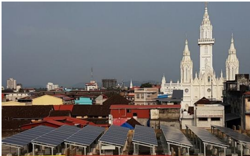
Figure 7: A 200kWp Solar Power Plant installed by Thrissur Corporation, a Local Self Government Institution in the State of Kerala

This approach worked well in Kerala resulting in electrification of local communities / institutions through the decentralised approach. Local Self Governments like Municipal Corporations, District panchayats, Block panchayats and Grama Panchayats were empowered to formulate their own Solar Photovoltaic Projects according to the feasibility studies conducted utilising local trained technicians. It created a new business model at the local level involving trained manpower and supply chain for meeting the Local Self Government targets for new PV projects in order to achieve the targets of carbon free communities. A typical example is the 200kWp Grid Connected Solar Roof-top Project installed by Thrissur Corporation as shown in Figure 7.