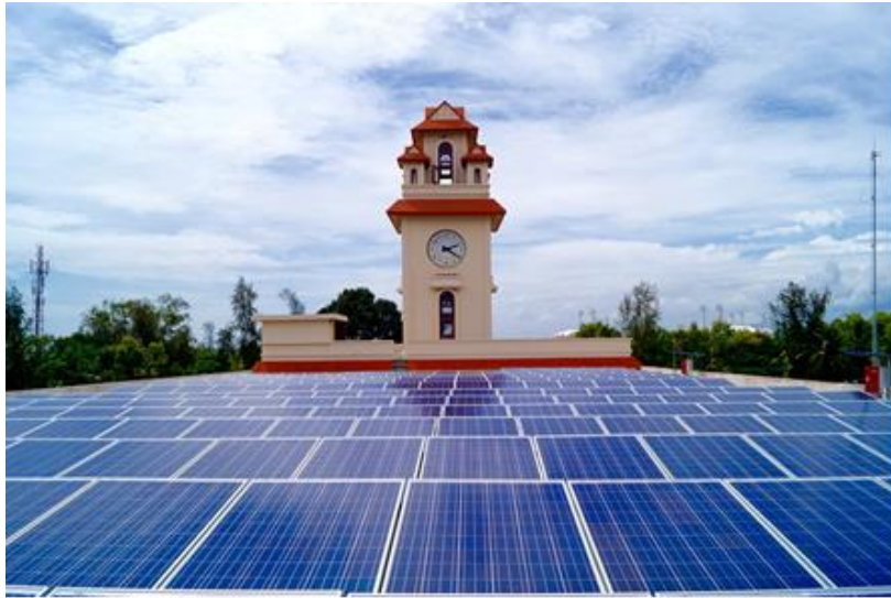
Figure 5: 100kWp Solar PV power plant at Kerala University Campus