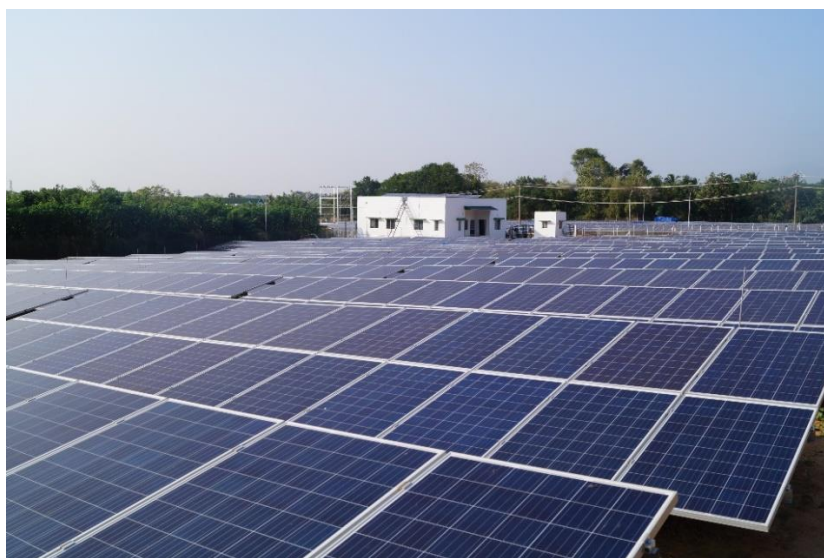
Figure 4: ANERT 2MW Kuzhalmannam PV power plant

ANERT has implemented many successful solar projects in the last decades. The projects include Remote Village Electrification Programme (RVEP), 10000 solar roof-top programmes, etc. ANERT has successfully implemented programmes of the Central Ministry (MNRE – Ministry of New and Renewable Energy) like the dissemination of Solar Lanterns, Solar Home Systems and Solar Street Lighting Systems, etc. ANERT has recently come up with a Grid Connected Solar Programme for residential buildings in the State called “Solar Connect” with both Central and State financial assistance. The off-grid solar programme for the residential buildings in the State is called, “Solar Smart”. ANERT has become the first solar Independent Power Producer (IPP) in the State by installing a 2MW Utility scale PV plant at Kuzhalmannam, Palakkad District in Kerala (Figure 4)