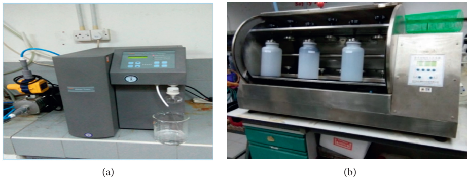
FIGURE 3: TCLP test assembly. (a) Water purification machine. (b) Automatic rotary agitator.

the binder via a wet process. Firstly, the conventional asphalt binder was preheated at a temperature of 160°C before blending. After that, the waste materials were incorporated