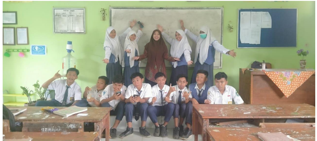
The last day of the treatment phase before doing the posttest