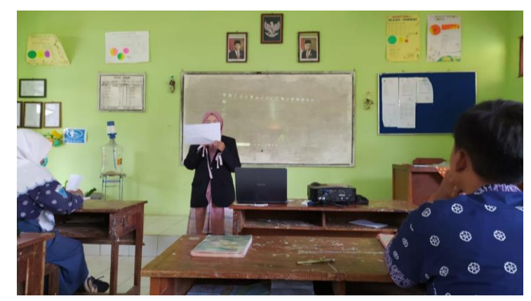
The researcher explained the procedure of shadowing technique