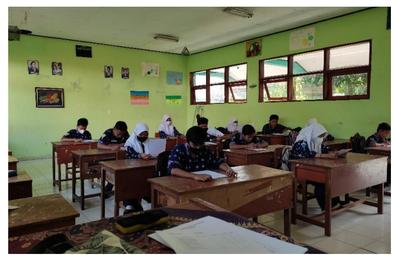
Students get the text of the consonant pronunciation test and prepare themselves before recording with the researcher