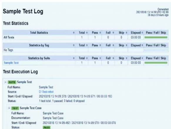
Figure 3: Sample test log and test execution log