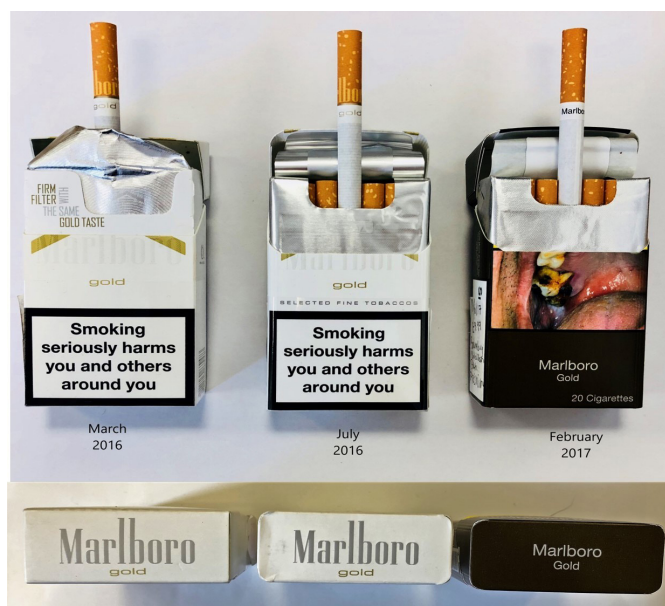
Figure 3 The evolution of Marlboro gold packaging from a straight edge pack to a branded bevelled edge pack with a new internal packet with pro-seal sealing mechanism, to standardised packaging maintaining these innovations.

Pack purchases revealed that best-selling premium brand family Marlboro changed significantly in July 2016 (2 months into sell-through), with the introduction of bevelled pack edges and a pro-seal closing mechanism (figure 3). Both features fundamentally changed the tactile nature of the pack which endured after full-implementation in May 2017 (online supplementary file 2 for a video of the modified Marlboro pack). To be compliant with the legislation, these packs must have been printed prior to May 2016.