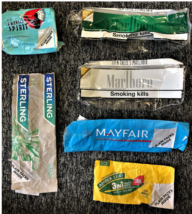
Figure 4 Branded outsiders post May 2016 (full implementation).