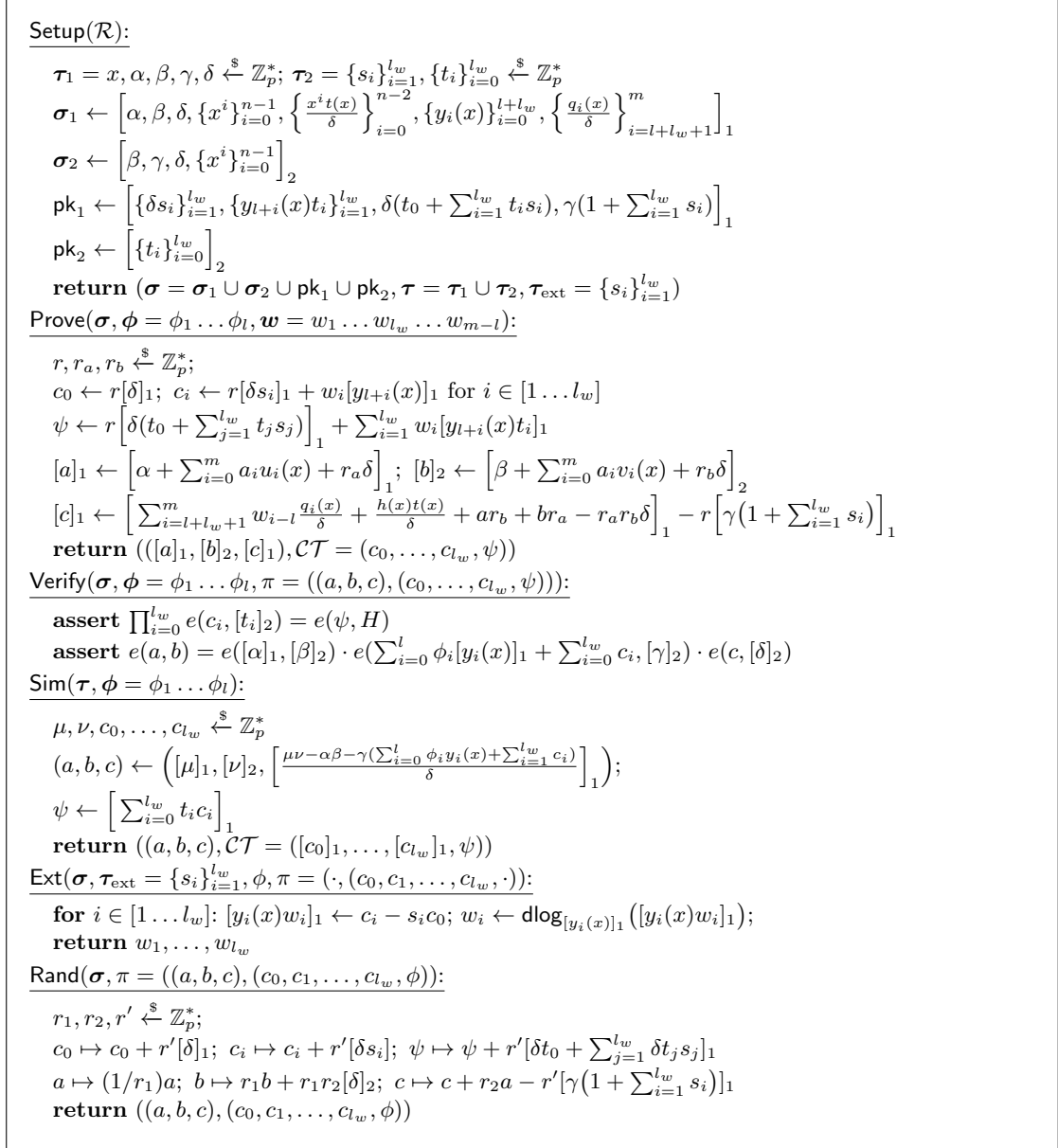
Fig. 4. Ext-Groth16: the black-box-extractable SAVER-inspired variant of Groth16. The relation \mathcal{R} must assert that inputs on witness input wires l \dots l + l_w are small enough to be efficiently decryptable. q_i(x) and y_i(x) are as for Groth16, e.g. in Fig. 1.

efficiency evaluation, but in this section we assume the circuit transformation to be an implicit part of the construction, since this suffices for our security analysis.