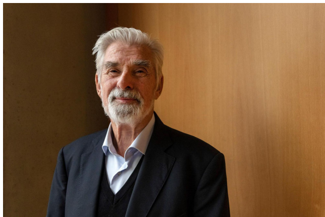
Fig. 1 Klaus Hasselmann.

variability on timescales of thousands of years. This recognition of the stochastic nature of climate variability has changed our understanding of observed climate.