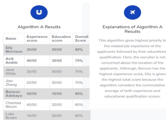
Figure 2. Results and Explanations of Results

We used a within-subject survey (pre-study/post-study questionnaire) to see if participants' perceptions of e-recruitment systems change after interacting with our explanation-enhanced prototype e-recruitment system.