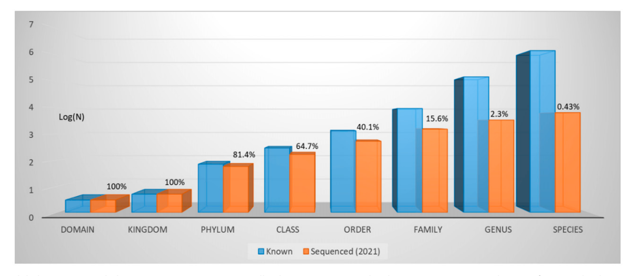
Fig. 1. Global progress in whole-genome sequencing across all eukaryotic taxonomic levels.

The EBP-affiliated projects have sequenced the genomes of 1,719 eukaryotic species, all of which have assemblies deposited in public domain databases (Table 1 and Dataset S1). Of these,