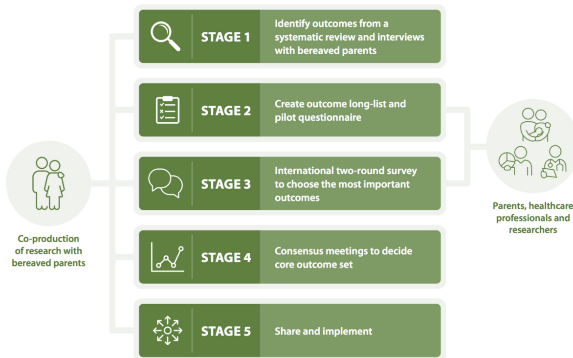
Figure 2 iCHOOSE study overview. iCHOOSE, International Collaboration for Harmonising Outcomes for Stillbirth research and care.

set for stillbirth care research with the overall aim of improving outcomes for parents and the wider family. This collaboration is endorsed by the Core Outcomes in Women's Health (CROWN) initiative; the Medical Sociology and Health Experiences Research Group, University of Oxford; the National Stillbirth Centre for Research Excellence, Australia, The Stillbirth and Neonatal Death Charity (Sands); Tommy's National Centre for Maternity Improvement, Twins Trust, Star Legacy Foundation and International Stillbirth Alliance (ISA).