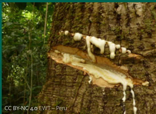
CC BY-NC 4.0 EWT – Peru

A proposed typology of rubber agroforestry systems (wild rubber, jungle rubber, permanent intercropping), and agroforestry practices (temporary intercropping, allowing natural regrowth, animal husbandry) that can be implemented in rubber plantations, synthesized from the literature and expert consultations. These practices can be combined with each other and with agroforestry systems (e.g. cover cropping + animal husbandry; temporary intercropping + permanent intercropping + animal husbandry). We have drawn heavily from previously published classification schemes, including Langenberger et al. (2017) and Stroesser et al. (2018). A more detailed discussion of systems follows in the text.