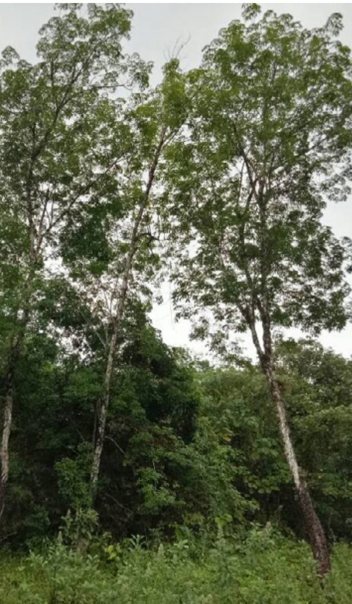
Natural regeneration rubber in Malaysia.