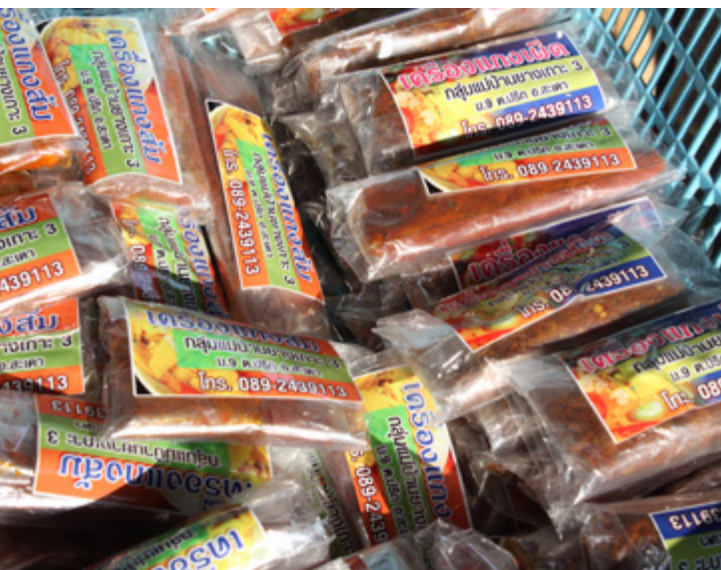
Chilli paste rural enterprise in rubber-dominated landscapes, Thailand.