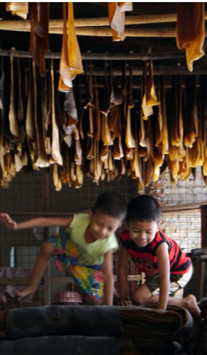
Children play under sheets of rubber on their parents' plantation.