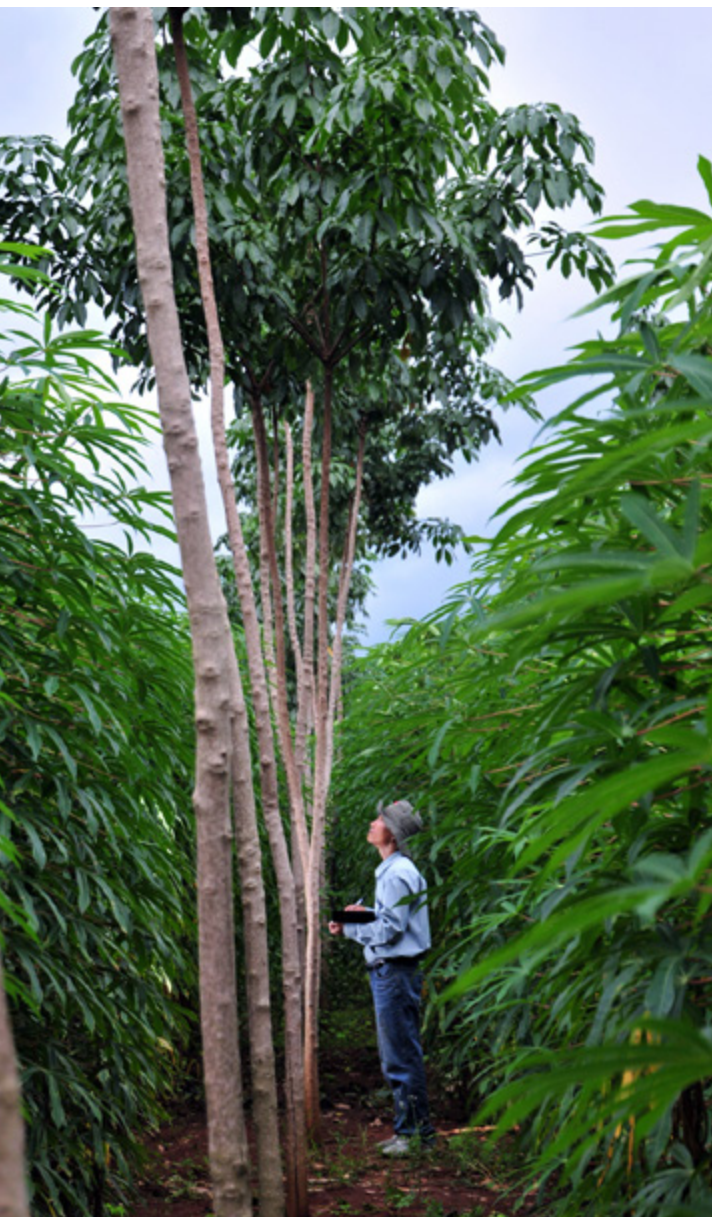
An agroforestry system intercropping rubber with cassava, Cambodia.

products, such as personal protective equipment (PPE), have not been large enough to offset reductions (Miller, 2020). Future forecasts are likely to be very uncertain (Gitz et al. , 2020). The pandemic has also affected supply chains, the operations of plantations, and the roll-out of sustainability initiatives and farmer support, making rubber small-