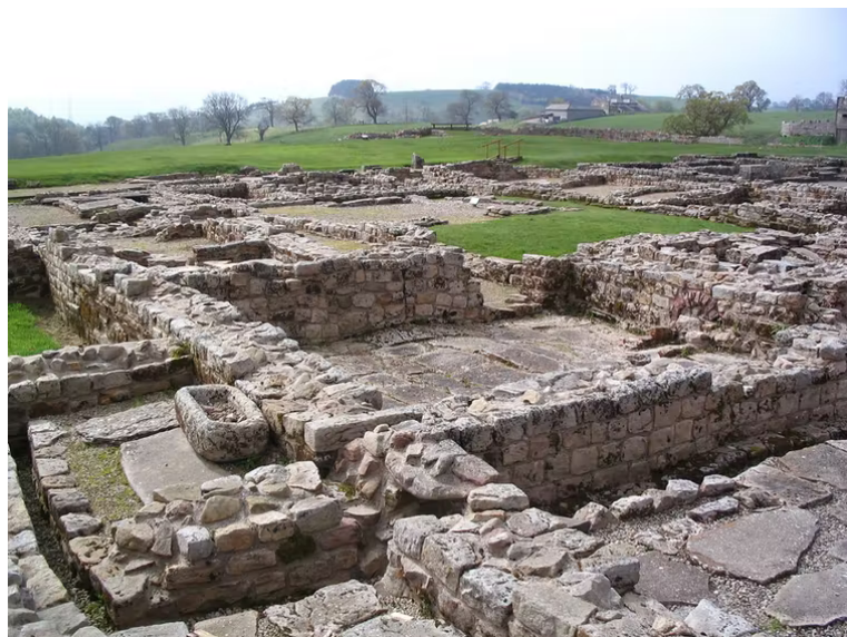
Vindolanda, a Roman fort, holds a huge range of archaeological evidence.

But climate change is bringing increasingly hotter summers and wetter winters to the UK, including unprecedentedly heavy local rainfall. This changes the landscape by washing away layers of soil and peat to reveal archaeological buildings, items and human remains.