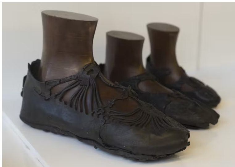
Items like these Roman black leather shoes are often found preserved in peat.

These remarkable finds are due to the fort's unique, peat-rich environment, which means that they're also threatened by climate-driven deterioration. We fear that finds which haven't yet been discovered may soon be irreversibly damaged due to the effects of climate change.