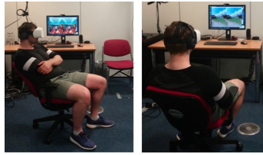
Figure 1: Experimental setup.

The FOVE-DK-0 HMD was used due to its infrared eye-tracking sensors, which have a frame rate of 120fps. The device uses an OLED display with a diagonal FOV of 100-degrees and has a resolution of 2560x1440 and a 70Hz refresh rate [19]. We did not correct for inertial measurement unit (IMU) drift as the “forward” direction reset at the start of each video and the accumulated drift was negligible. A pair of BOSE headphones played the videos’ sound to participants on a medium volume. The cables of the HMD and