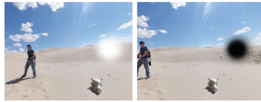
Figure 2: The flicker at two time points in the exploration video.

Based on findings from the pilot study, both cues lead the user back to each ROI once when his/her gaze moved more than 18-degrees visual angle away from the ROI's center. The re-direction ensured that users could clearly identify ROIs even if they missed