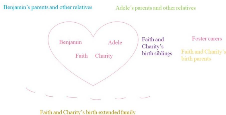
Figure 1. FAMH4 (different-gender couple) family map depicting the “core family unit”, including both parents and their two adopted daughters, and intentional kin.

proceeded to represent other kinship connections (usually where kinship was established through biological relatedness or partnership connection) and thus included their own extended family and their adopted child's birth family on their family map representations. In the present study, we focus on examining the intentional kinship connections that adoptive parents also included on their family maps.