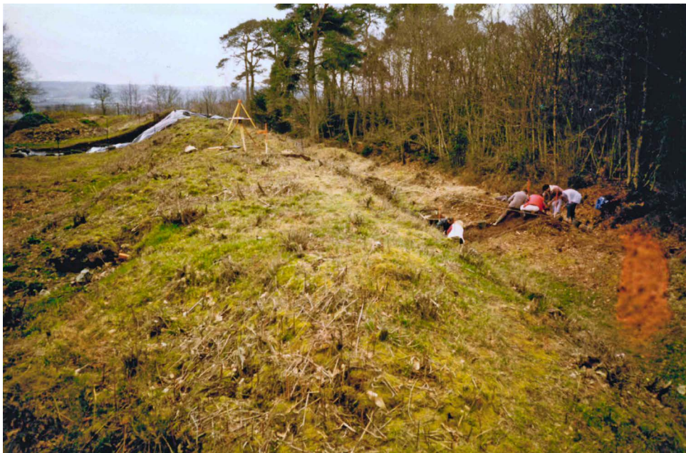
Figure 3. Excavation work carried out at the western perimeter of the proposed encampment at Péran in 1985 (looking south).

In characterising the construction of bespoke defences for viking bases, Continental authors customarily relied on verbs like (circum)saepire and circumdare , both of which signify processes of encircling or surrounding, and thereby suggest a (semi-)circular configuration of otherwise indeterminate proportions (Cooijmans 2020: 143). On one occasion, in Louvain (891), local fortifications were noted as being absent from the waterfront side(s) of