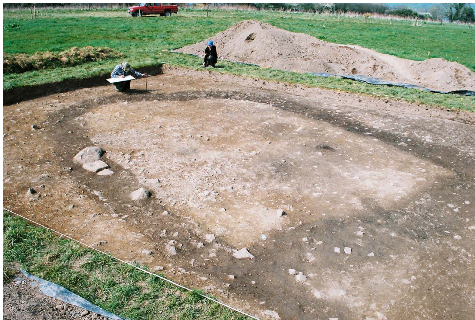
Figure 4. Pre-excavation view of the sub-rectangular structure from Woodstown.