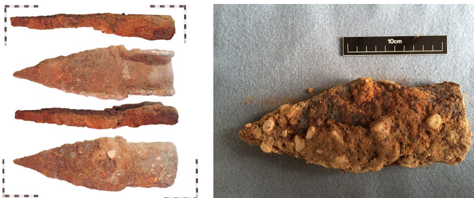
Figure 2. Analogous iron ploughshares recovered from Torksey (left) and Foremark (right).

overwinter in the Hesbaye, similarly ‘gather[ed] crops of various kinds together’ (Reuter 1992: 97). By the early 890s, the apparent prevalence of these proceedings even prompted English forces to adopt a scorched earth policy when besieging vikings at Chester, cutting off access to local crops and cattle (Swanton 1996: 88). In spite of such countermeasures, ambulant vikings were often seen to have purposely commandeered monastic, urban, or otherwise pre-existing centres of wealth and population for their encampment needs. As nuclei for their encompassing economic networks, locales like these would have presented their new occupants with already accumulated stockpiles of sustenance, alleviating the need to acquire these elsewhere (McLeod 2006: 144–5). In 865, for example, a viking host temporarily based at the monastery of St Denis emptied the complex of its contents before abandoning it (Nelson 1991: 128). Two decades later, analogous forces anchored at the abbey of St Germain-des-Prés likewise helped themselves to its local grain supplies, ‘fill[ing] a cart with sheaves and dr[iving] it across the fields’ (Dass 2007: 69).