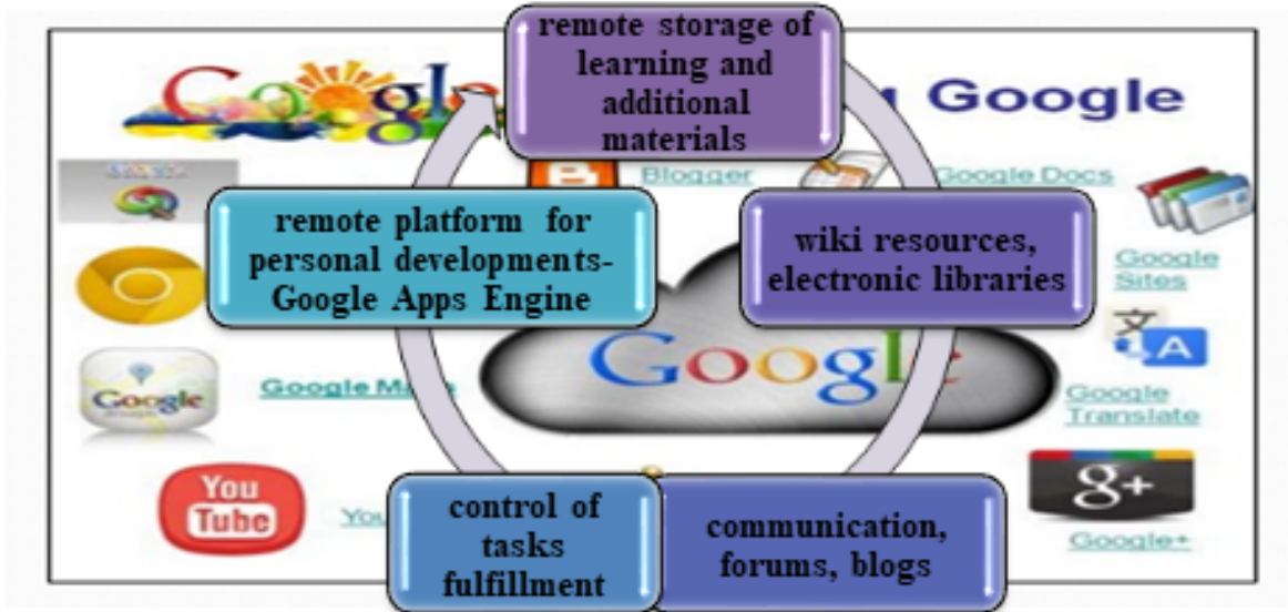
Figure 2: Functional opportunities of Google Apps Education Edition