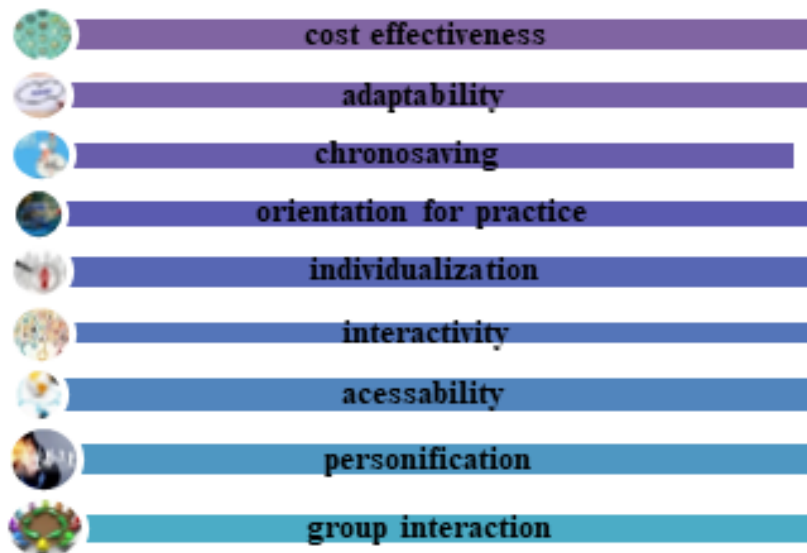
Figure 3: Advantages of Google Classroom implementation into the educational process