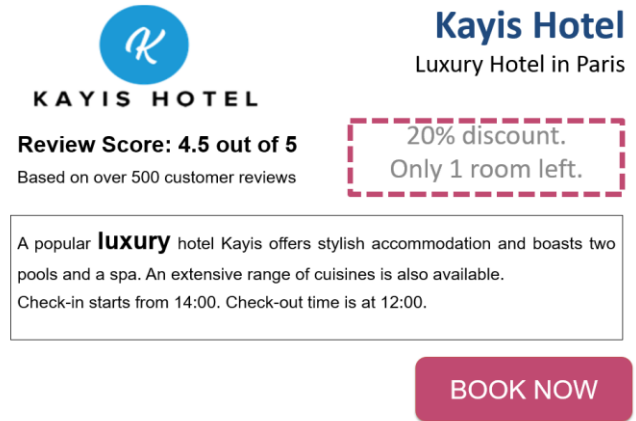
Figure 2. Limited-quantity scarcity message experimental stimulus.

To control for confounding factors, several aspects of the experimental stimuli were held constant. These include, for example, the website interface, the name and the logo of the hotel, the volume of reviews, the average review score, as well as the description of the hotel. A fictitious hotel name and logo was used to control for participants' attitudes and predispositions.