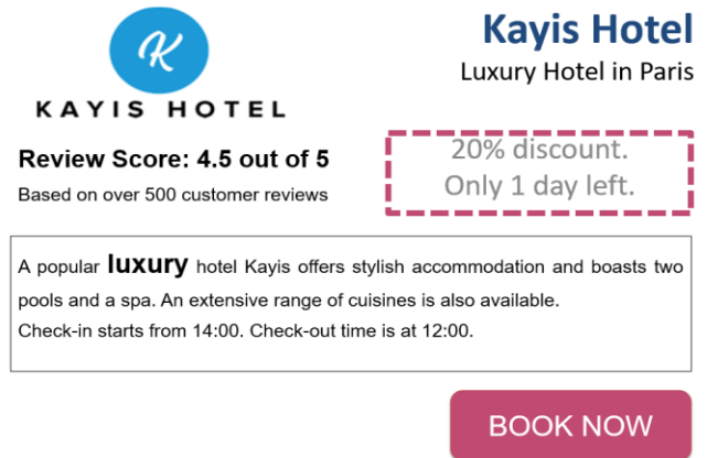
Figure 3. Limited-time scarcity message experimental stimulus.