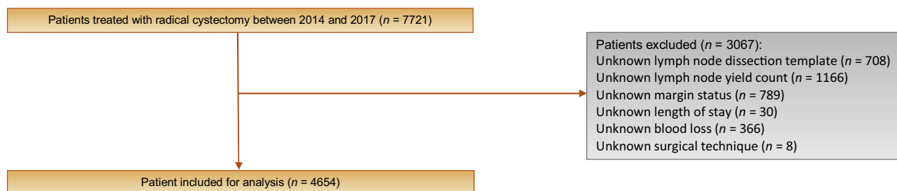
Fig. 1 – Inclusion and exclusion criteria used to determine study cohort.

A total of 455 patients (12.2%) had a PSM, including 222 patients (5.9%) with soft tissue/circumferential involvement and 119 (3.2%), 83 (2.2%), and 31 (0.8%) patients with ureteric, urethral, and unknown margins, respectively (Table 1). The soft tissue PSM rate for pT2 patients was 0.5%. The median lymph node yield was 13.0 (IQR: 8.0–19.0), and 3214 patients (69.1%) had a lymph node yield of ten or more nodes. A total of 3142 patients (67.5%) met our “adequate LND” definition. Mortality following admission for RC was observed in 1.8%, and the median hospital LOS was 10.0