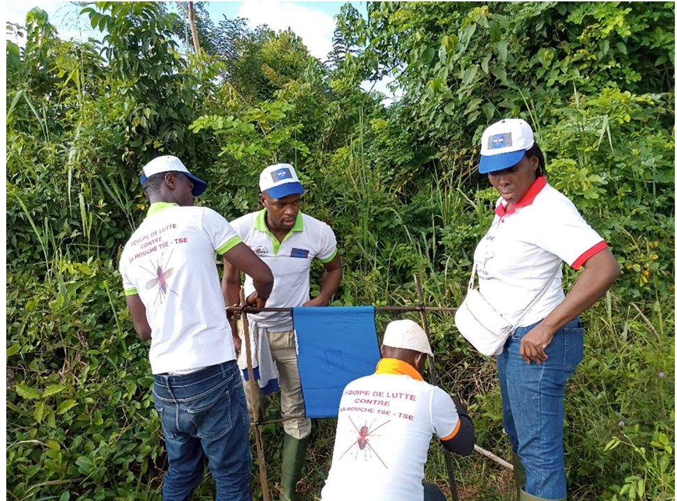
Fig 3. A Tiny Target deployed at the relic forest/human settlement interface.

https://doi.org/10.1371/journal.pntd.0010033.g003