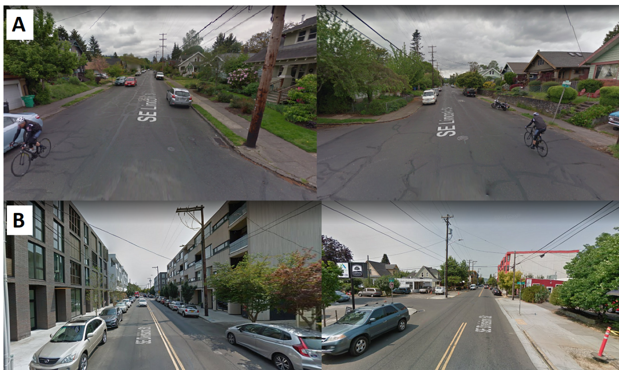
Figure 1 Example of a neighborhood greenway (A) and a non-greenway (B)

For each dataset, a preliminary exploration was conducted, whereby class two observations were aggregated into 15-minute intervals. The mean speed, mean gap time between vehicles, and the vehicle count were calculated for each 15-minute interval. Scatterplots of the mean gap time or vehicle count versus the mean speed were created to investigate relationships between these metrics. A distinct pattern difference was revealed between datasets from neighborhood greenways and those from non-greenways. Non-greenway datasets exhibited evidence of a positive relationship between mean speed and mean gap time or a negative relationship between mean speed and vehicle count. Conversely, these relationships were absent in almost all (97%) of the neighborhood greenway datasets. More details on the relationship between mean speed and mean gap time can be found in (23).