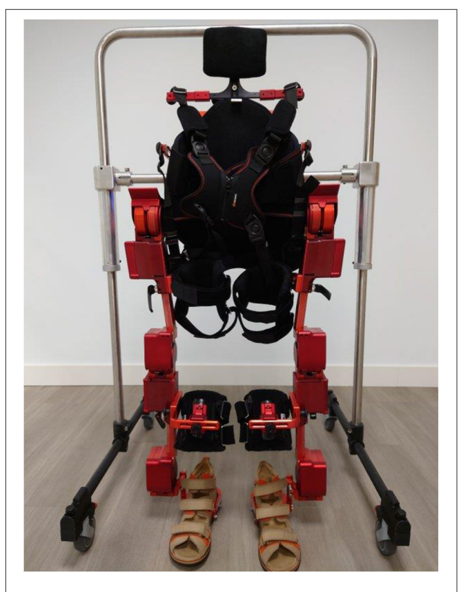
FIGURE 1 | ATLAS2030 exoskeleton.

ATLAS2030 exoskeleton (Figure 1) is a bilaterally driven wearable exoskeleton which offers eight actuated degrees of freedom (DoFs), four per leg (hip, knee and ankle rotations