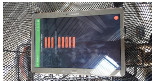
Figure 1 b. Pad running the physics toolbox app attached to a test bicycle

The conceptual setup is referred to as recording “extended floating bicycle data” or “xFBD”. Parameters obtained from the multi sensor array are shown in Table 1.