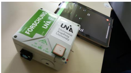
Figure 1 a. Box including the sensor array