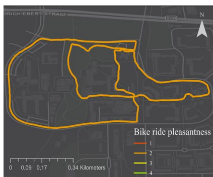
Figure 3.. Initial test results for humidity and temperature - detected levels of bicycle ride pleasantness, with 1 showing the very unpleasant, 2 – unpleasant, 3- less pleasant and 4 pleasant ride

The results of the initial case study reflect the possibility of analysing bicycle ride in their relation to “pleasantness”. In this particular case, the data does not show differences in the tracks. The measurement days are somewhat grey with little variation of temperature and humidity in the study area. Therefore, the output shows an unpleasant bicycle ride for all points. These case study results are expected, still the conceptual application of a fuzzy logic approach to analyse the sensor data is successful.