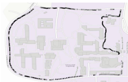
Figure 2 b. Track b

Recorded data generated for this study is available at https://github.com/roegechr/xFBD . The track a includes 138.404 points, track b 155.032 points. The data points show some missing records as the GPS positioning is not accurate in some parts of the track.