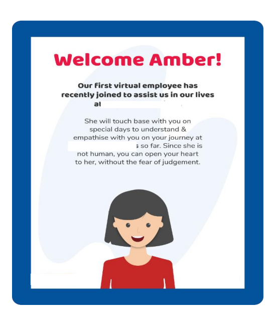
Figure 2. Introduction Communication of the Virtual Assistant

The virtual assistant reiterated a similar message on communication privacy in its first communication. This introductory mail included a disclosure about who would access the feedback that employees provided in the chat. In this case, we configured access to feedback provided to be visible to the chief executive operator (CEO) and the HR head. This communication from the CEO's desk helped build confidence and trust