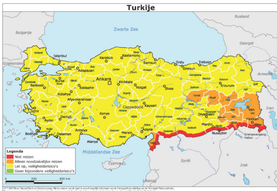
Figure 4. Dutch Foreign-Travel Advice Turkey (2016–18)

Note: Red: advise against all travel; orange: advise against all but essential travel; yellow: pay attention to safety risks; green: no particular safety risks.