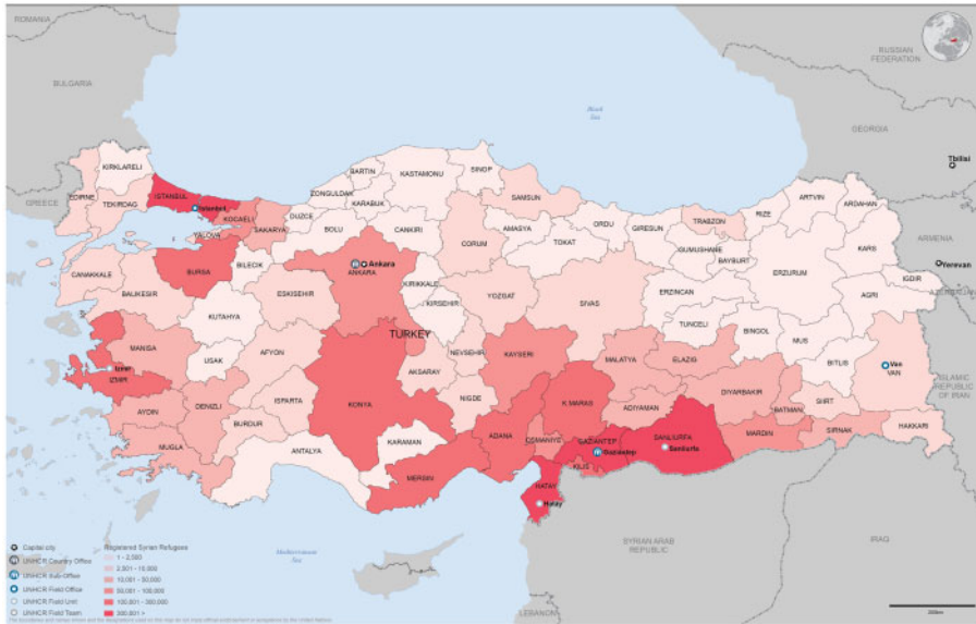
Figure 3. Number of Syrians in Turkey