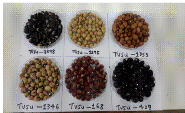
Figure 1. Phenotypic variations among African Bambara groundnut collections

descriptive statistics, one way analysis of variance (ANOVA) and principal component analysis was done with subsequent correlation coefficients utilized to construct a dendrogram so as to view the groupings and relatedness among these collections of Bambara groundnut viz a viz the different yield parameters and their country of origin. Also Microsoft excel 2010 was used for data entry and simple charts.