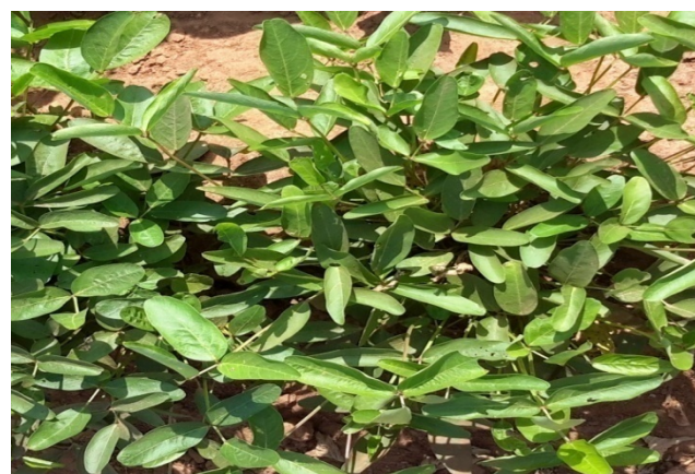
Figure 2. Bambara groundnut (at 7 weeks growth at IITA, field)