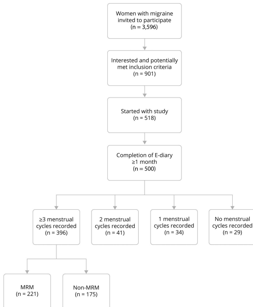
Figure 1 Flowchart of Included Participants

Pain coping (rated 0–10) was lower during perimenstrual attacks compared to nonperimenstrual attacks in women with a natural menstrual cycle (adjusted mean difference -0.2 , 95% CI -0.3 to -0.05 , p = 0.001 ), but not in women on hormonal contraceptives (adjusted mean difference -0.6 , 95% CI -0.9 to -0.3 , p = 0.693 ). Headache intensity (rated mild/moderate/severe) was higher during perimenstrual migraine attacks in women with a natural menstrual cycle (OR 1.4, 95% CI 1.2–1.6, p < 0.001 ), and even higher in women on hormonal contraceptives (OR 1.7, 95% CI 1.2–2.6, p = 0.007 ). A complete overview of all outcomes for perimenstrual vs