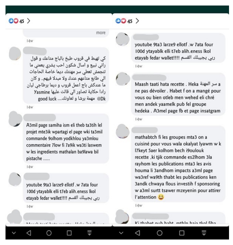
Figure 2. Screenshots taken from Facebook, retrieved on 5th of September 2020

According to Gervasio and Karuri (2019), when people occupy online platforms, they reconstruct language in ways that match the constraints and affordances of different digital spaces. Users of social media take photos and upload them or share status updates in real time and space, rendering the process a naturalized practice. This being the case, observing Facebook Stories, similar features were found. Taking the example of G.R. who, in a time slot of two hours, posted seven stories (see figure 3). From the seven stories, three were in English, one in Tunisian Arabic, one in Modern Standard Arabic, one in Egyptian Arabic, and one in French and Tunisian Arabic. These mixtures of languages and more are usually found in Tunisians' Facebook or Instagram Stories. The variation in language usage and graphics is also strongly present. When browsing through many stories, we note that, apart from other languages, variants of the Arabic language are also present. People tend to self-express in the social media while spontaneously displaying their linguistic identities in real time and space.