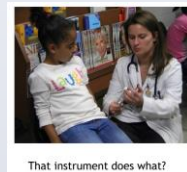
That instrument does what?