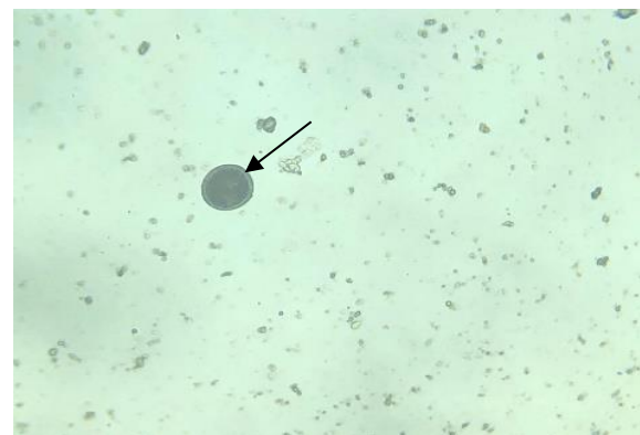
Figure 1. Toxocara cati egg

The detection of worm eggs from 30 samples of domestic cat feces at the Surabaya clinic found two positive Toxocara cati eggs, or about 6.67% of the 30 total samples. Based on microscopic examination with 100 times magnification and based on morphology, Toxocara cati eggs have the characteristics of oval, jagged, and thick-walled eggs (Koesdarto et al. , 2000).