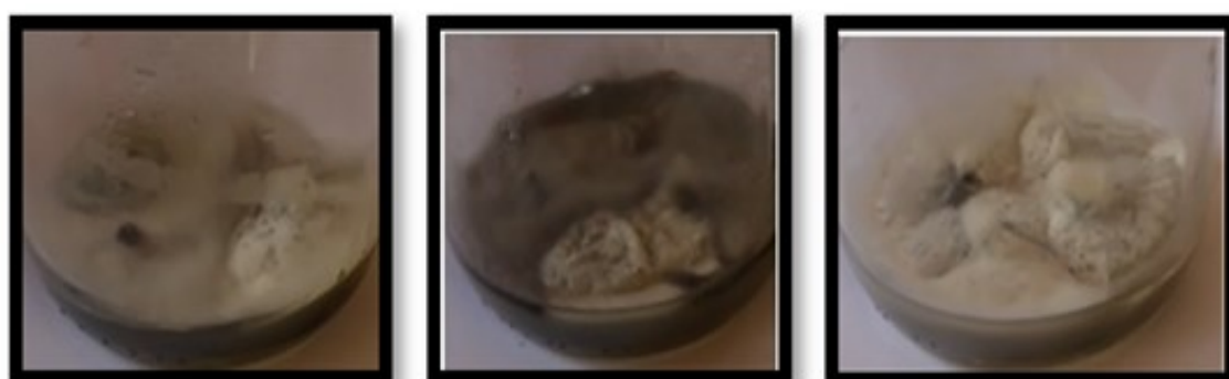
Figure 3. fungi contaminant on stem leaves