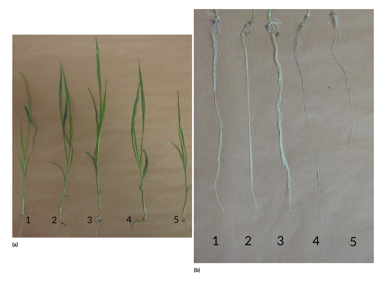
FIGURE 2 Growth of sweet sorghum cv. Numbu which was inoculated by potential endophytic bacteria after 30 days of planting; 1. positive control, 2. PIB1B isolates, 3. BB7 isolates, 4. PLB1B isolates, 5. negative control.

the diversity of endophytic bacteria can be thought of as part of the rhizosphere and/or the bacterial population in plant roots (Hallmann et al. 1997).