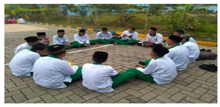
Figure 1.2 Circle Pattern on Mentoring Activities