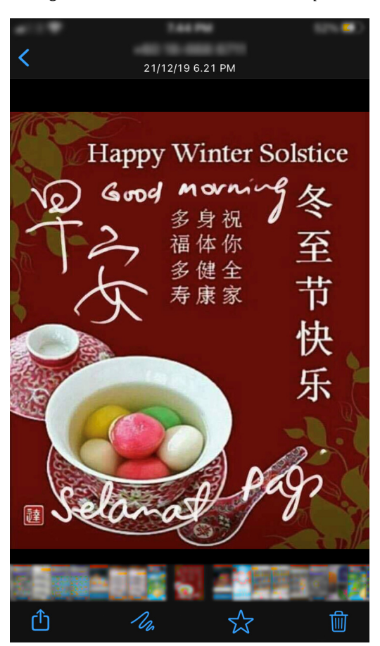
Figure 3 Facing Intercultural Communication Competence