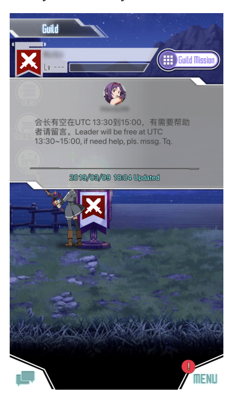
Figure 2 Guild System and Policy

the guild. Moreover, language practices in this guild were dominated by English and Mandarin (see Table. 3). The guild system gives a chance for gamers – editable only for the commander and vice commander – to write in the notification board that pops up when the avatar moves around the guild flag. Top-down LP made by the commander or vice commander intentionally concealed gamer-to-gamer language use in the guild. Moreover, MMORPG is dominated by synchronous activities and clock-driven time (Harviainen & Vesa, 2016) where the word "UTC" has been adopted from retrieval core to mediate different time zones of gamers. Therefore, this guild expected Mandarin speakers that would consider at the first place as language practices and English as the second one.