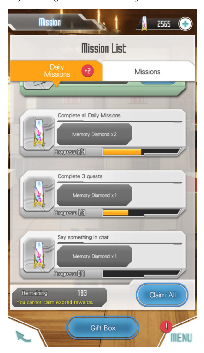
Figure 1 "Say Something in Chat" under the Policy

reading activities in MMORPG is to comprehend information within games to achieve the rewards due to developing each gamer's account.