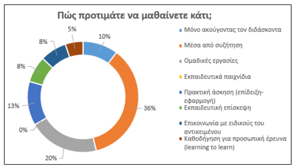
Figure 2: Preferred learning methods

The preference of more relaxed participation is reaffirmed yet again by the characteristics that older people would choose for the ideal instructor: Primarily, to speak in a way that is understood (29%), to be pleasant (18%) and not to assign homework (16%). They also did not ascribe any weight to the instructor's inclination to provide