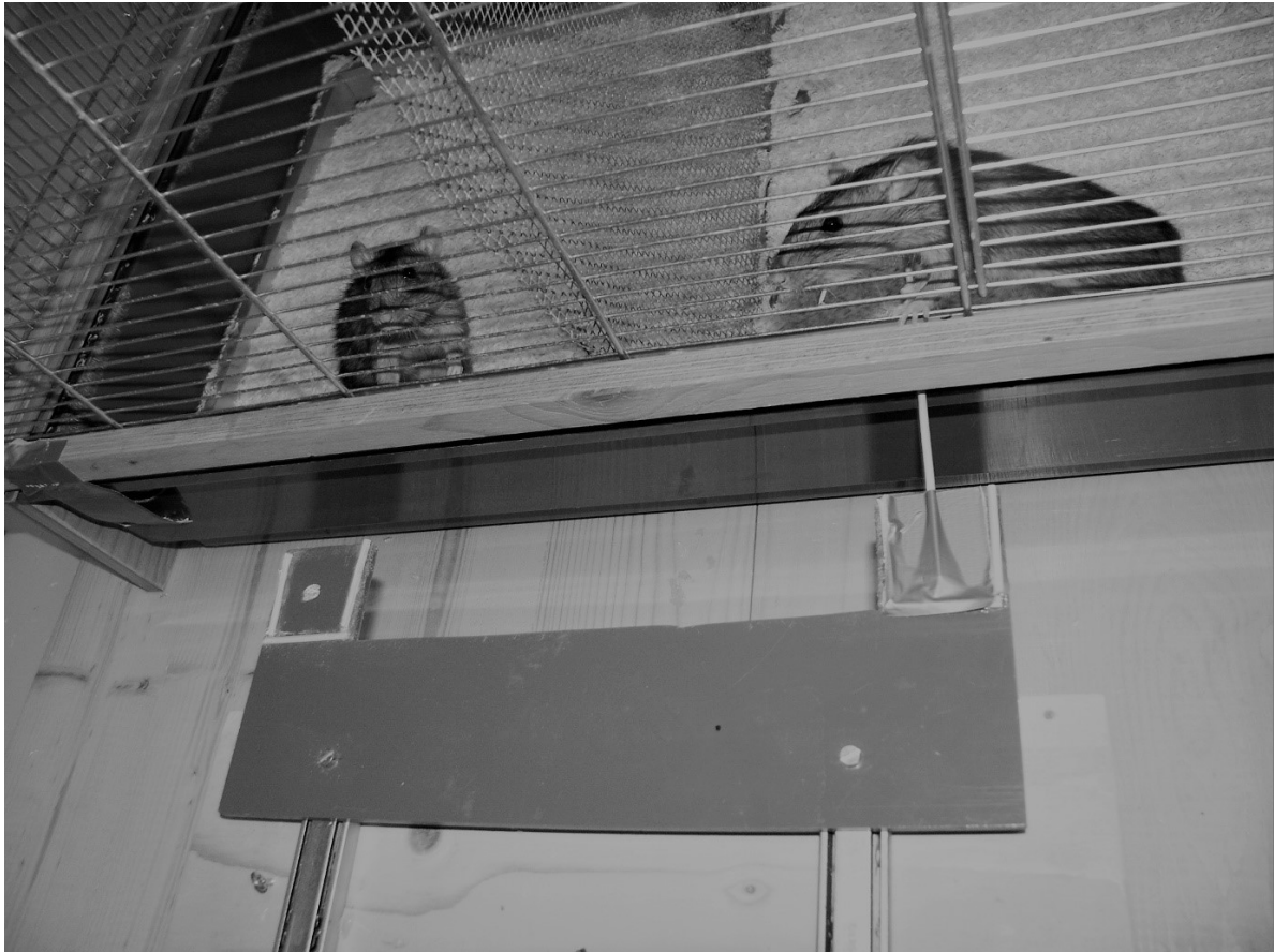
Figure.2. Food-exchange apparatus.

The picture depicts one apparatus of a two-player food exchange task, which has been established by Rutte & Taborsky, 2007. In front of an experimental cage, which hosts two separated rats, is a movable platform that is connected to a stick. By pulling the stick, the platform moves into the cage and provides food only to the recipient. Afterwards the roles can be exchanged and rats are able to pay back the favour. Other paradigms following the same logic include for instance Skinner boxes (e.g., Wood, Kim, & Li, 2016) or T-mazes (Márquez et al., 2015).