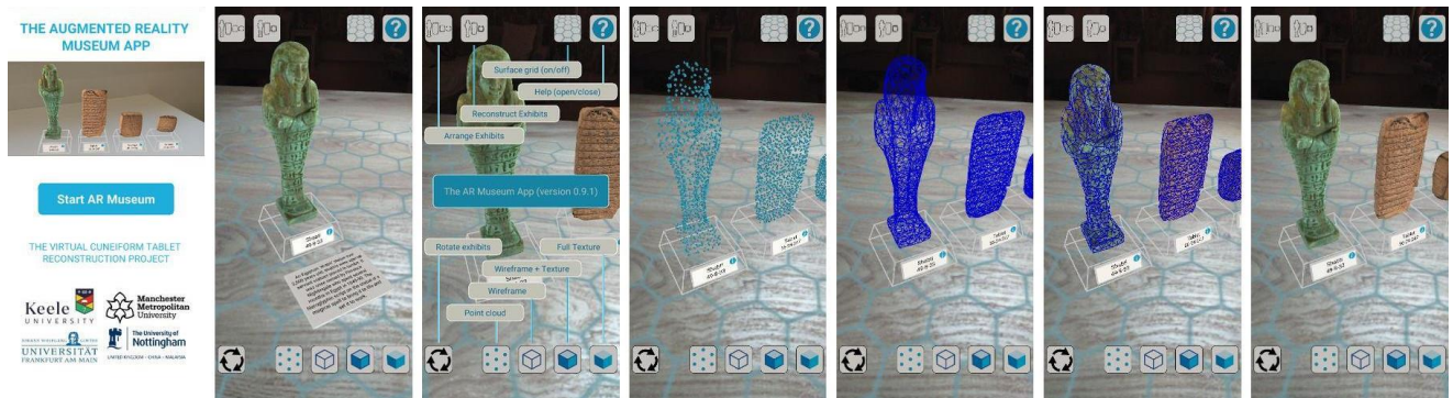
Figure 3: Processing for Android Augmented Reality