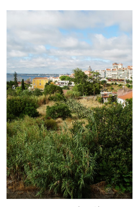
Figura 5 Traveling Plant