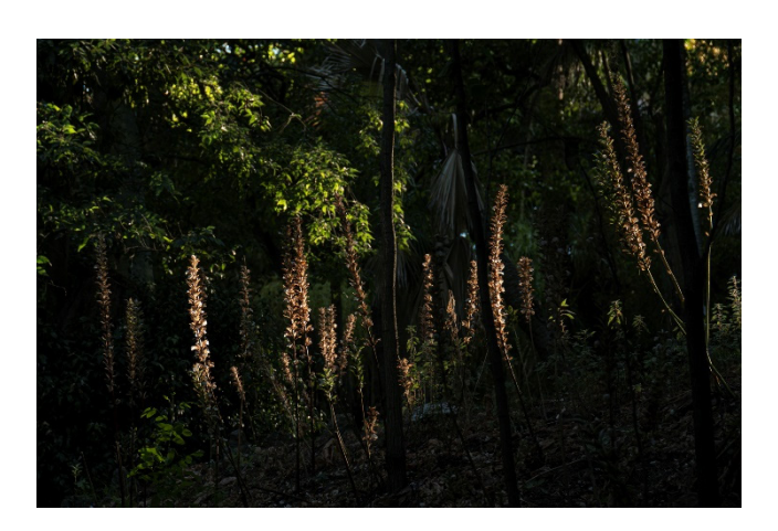
Figura 4 Traveling Plant