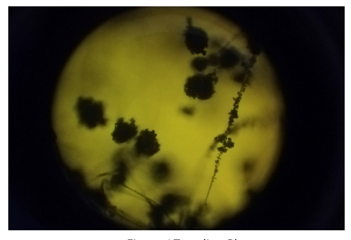
Figura 6 Traveling Plant

This project will be developed through a series of artworks and events that will be created in different locations all over the world and take place over the course of several years and at a very slow pace, in line with plants' natural rhythms. It will unfold collectively via a network of participating host organizations and curators that will define, carry and support each step and the new creations and events locally. It will be open to all kinds of aesthetics and artistic mediums. All artworks and related events will aim to provide the time and space that allows us to listen and adapt to the plants' needs in new and fruitful ways. At each stop of the plant's travel, there will be an art commission - an artwork, a full exhibition, or an evening event - on plants. Connecting to the local community and to the Traveling Plant network it will allow us to connect in meaningful ways.