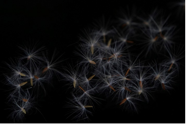
Figura 2 Traveling Plant

Additionally, token from each event at a Host Organization will be brought into a standardized format and added to the physical collection of tokens of all The Traveling Plant stops along the plant's route. This physical collection will also be accessible virtually.