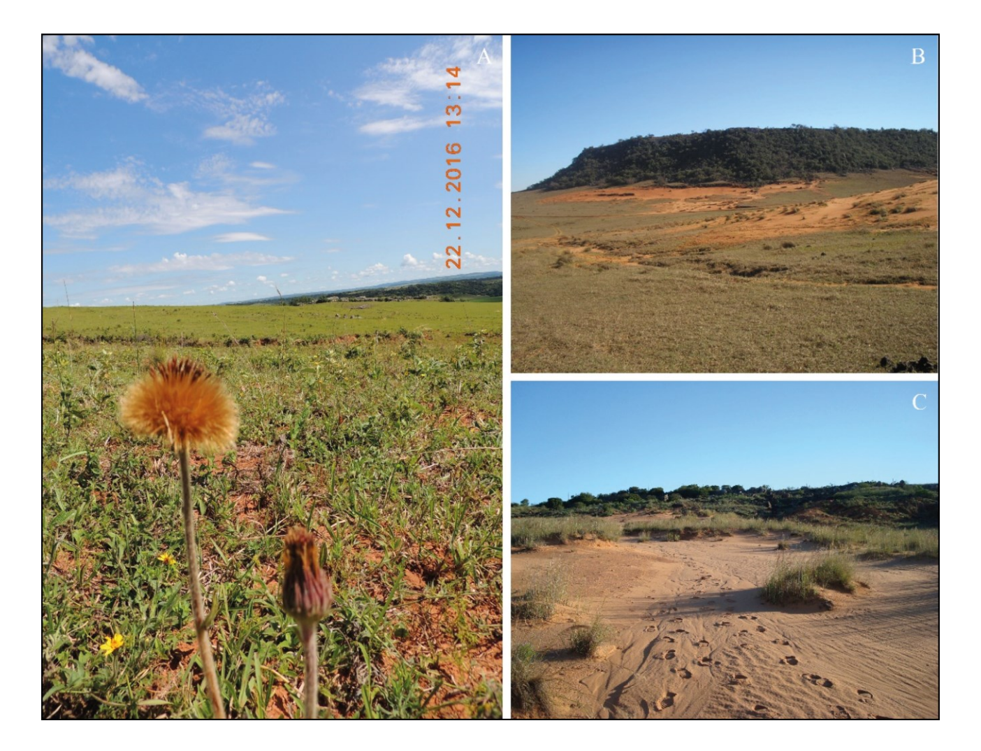
Figure 2 – Campos dos Areais. A. Grazed field area without arenization, although the soil is exposed; São Francisco de Assis city, near BR 377 (29°35'35.91''S and 55°09'11.80''W); B. Sandy field area in Cerro da Esquina, São Francisco de Assis city (29°31'07.32''S and 55°07'40.31''W); C. Ungrazed sandy field area in Cerro do Tigre, Alegrete city (29°39'32.42''S and 55°24'04.10''W)

the total richness. In addition, herbaceous species were predominant (72.2% of the richness), followed by shrub (9.58%), subshrub (7.87%), tree (6.16%), and climbing (5.13%) species. This confirms what was mentioned in the previous paragraph regarding the predominant habits and the greater representation of Poaceae, both in number of species and in percentage of ground cover.