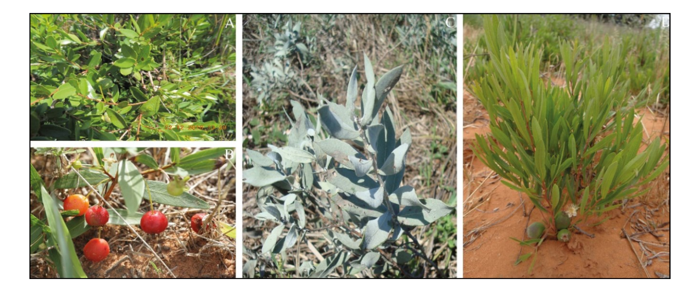
Figure 10 – A. Campomanesia aurea O.Berg (Myrtaceae); B. Eugenia pitanga (O.Berg) Nied.; C. Psidium salutare var. sericeum (Cambess.) Landrum.; D. Eugenia anomala D.Legrand with green fruits

Studies with aqueous and ethanolic extracts of Eugenia arenosa Mattos (Fig. 5C), E. pitanga (O.Berg) Nied. (Fig. 10B), and Psidium salutare (Kunth) O.Berg (Fig. 10C) showed in vitro leishmanicidal activity against promastigote forms of Leishmania amazonenses (KAUFFMANN et al., 2017a). The essential oil of E. pitanga also showed action against L. amazonenses, with an inhibitory potential similar to that of the standard drug pentamidine (KAUFFMANN et al., 2017b). Another study with extracts of Eugenia anomala D.Legrand. (Fig. 10D), E. arenosa, and E. pitanga showed in vitro antimicrobial and antibiofilm activity against S. aureus and Pseudomonas aeruginosa (KAUFFMANN et al., 2017c).