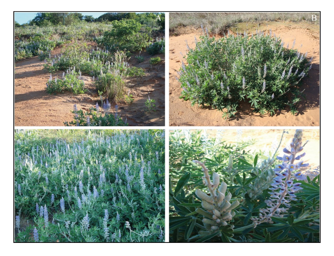
Figure 7 – A-B. Population of Lupinus albescens Hook. & Arn. in an ungrazed native field area in Cerro do Tigre, Alegrete city; C. A large specimen; D. Inflorescence detail

Furthermore, species of the genus Butia can be widely explored. According to Marchi et al. (2018), B. odorata (Barb.Rodr.) Noblick has multiple uses, with potential for food, ornamental, melliferous, and handicraft applications. These same uses can be cited for all other species of the genus due to the similarity in their structures, as is the case of B. lallemantii Deble & Marchiori (Fig. 8A-C), endemic to Campos dos Areais and widely occurring in preserved portions of native field.