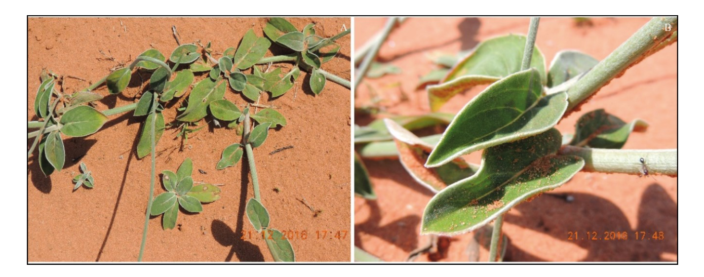
Figure 6 – Froelichia tomentosa (Mart.) Moq. (Amaranthaceae) A. Habit; B. Leaves detail

Viana (2018) showed that F. tomentosa, in addition to presenting C4 metabolism, presents opposite crossed phyllotaxis, with thickened leaves at the base of the plant and tomentose indument that contributes to the maintenance of a saturated atmosphere of water vapor around the stomata (ELIAS et al., 2003). This also reduces water loss by evapotranspiration and the intensity of sunlight coming into the mesophyll, preventing increased internal temperature and damage to the photosynthetic apparatus (FANK-DE-CARVALHO et al., 2012).