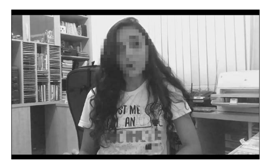
Figure 1. Video pitch