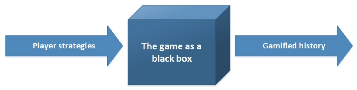
Figure 2. The game black box process.

roleplaying may choose to play and interact with the game as a black box. However, while this approach to EUIV can help the player focus on history, the extent to which they do so will always be dependent on how that player approaches the game. Thus, a black box approach to EUIV shifts the player's attention to engaging in historical roleplay and narratives rather than making choices to primarily maximise player benefits within the game's algorithm.