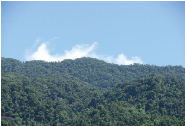
Figure 3. Vascular plants distribution type 2 (over 900m).

some dominant plants such as Pinus dalatensis Ferre, Cunninghamia lanceolata and Rhodoleia champion Hook.