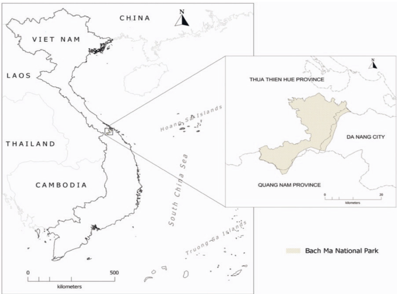
Figure 1. Location of Bach Ma National Park, Thua Thien Hue Province, Vietnam

The annual rainfall is about 8,000mm/year at the Bach Ma summit area. The rain starts from September to December accounting for over 70% of the total annual rainfall. The park has a watershed function of water conditioning for the major rivers in the region such as the Truoi river, Cu De river, and Ta Trach river (upstream of the Perfume river). With such complex topography, it is not surprising that this area is home to 1,715 species of fauna (7% of the total number of species in the country) and 2,373 species of flora and mushrooms, which accounts for nearly 17% of the total number of flora species in the country (BMNP, 2020).